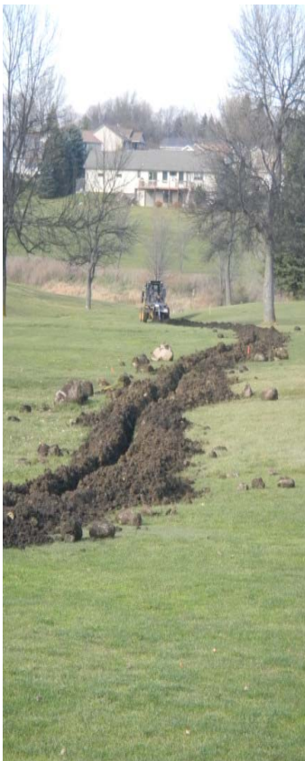
The trench through hole 2 and hole 8.

The Clear Lake Golf Club is a non-profit organization with a lot to offer. The course is fun for all ages and skill levels. The pro shop carries Clear Lake Golf Club merchandise that would make perfect gifts for the golfer in your life. The clubhouse is open for lunch, private parties and is a great place to go to relax with friends!